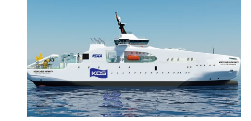
KDDI Cable Infinity