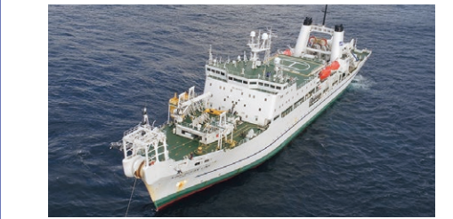
KDDI Ocean Link